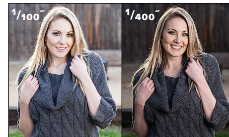
^ Shutter Speed controls ambient light. The background on the right is darker due to the use of a faster shutter speed ( 1/100'' to 1/400'' = two-stop change).

Shutter speed controls how ambient light (but not flash) is recorded. Use a faster shutter to dim the ambient (background light) and a slower shutter to make it brighter. If you exceed your camera's sync speed, activate High-Speed Sync. See page 11.